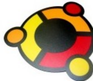
Ubuntu Mouse Mat € 4.98