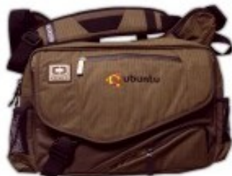
Ubuntu Ogio Messenger Bag € 53.78