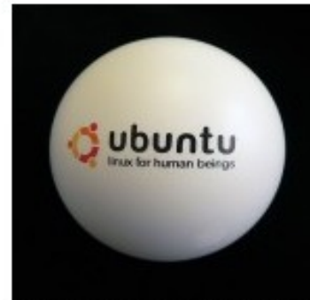
Ubuntu Stress Ball € 2.49 € 2.05