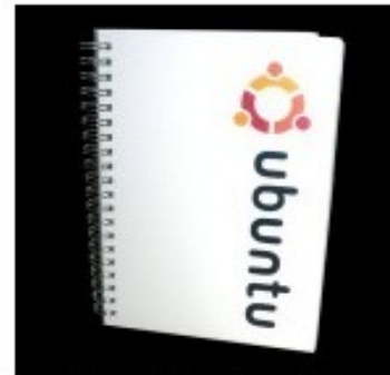
Recycled Ubuntu Notepad € 3.98