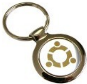
Ubuntu Metal Key Fob € 2.49 € 2.05