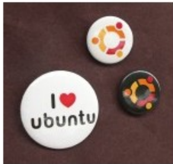
Ubuntu pin-badges € 3.51